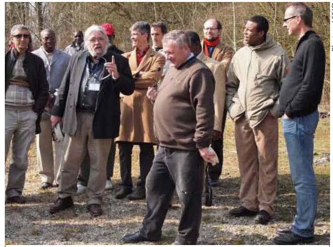
Delegates at the field visit organized by the agricultural chambers of the Beauce region

quantitative status" is clearly defined in the WFD, this is not the case for the complex "good chemical status." So the lessons learned in the last 10 years were presented.