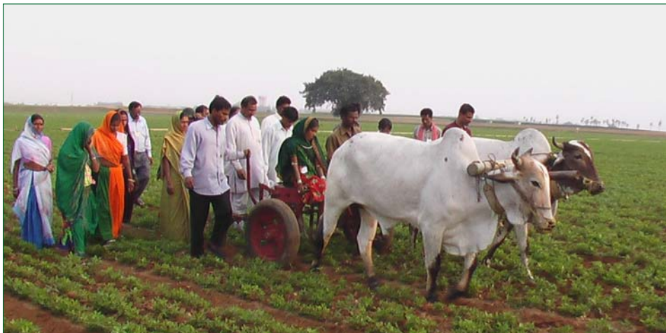
Women empowerment in a watershed, Andhra Pradesh, India

Large yield gaps with farmers' yields being about 2 to 4 times lower than the achievable yields for major rainfed crops are observed in Asia, Africa and CWANA (Central and West Asia and North Africa) regions. There is an urgent need to develop a new paradigm for upgrading rainfed agriculture and the business as usual approach can no longer achieve the goal of food security. Vast scope exists to unlock the potential of rainfed agriculture through sustainable management of natural resources through integrated watershed management (IWM) approach. The IWM approach provides a framework for